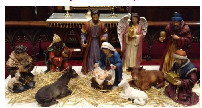
Love came down at Christmas

Please invite family and friends along to these services.