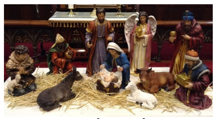
Love came down at Christmas

Please invite family and friends along to these services.