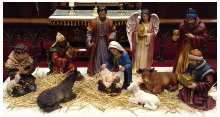
Love came down at Christmas

Please invite family and friends along to these services.