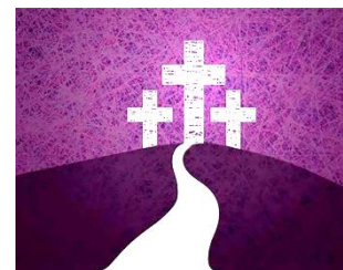
TRAVELLING WITH JESUS

“Let’s think chronologically: Jesus began his ministry when he was thirty years old. Like so many others, he joined the throngs of people who flocked to the Jordan River to be baptized by John the Baptist. Then he went out into the wilderness to fast and pray for forty days. Then he returned to Galilee to share the Good News of God’s love, heal the sick and proclaim the dawning of God’s great kingdom on earth.